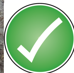
Designed to be used this way up. (lugs up)