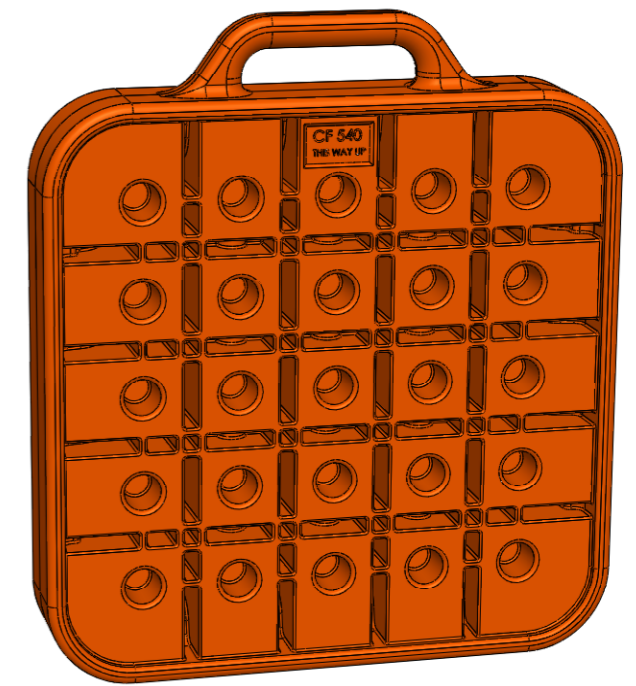
UPRIGHT CARRYING POSITION

10mm high safety perimeter all the way around