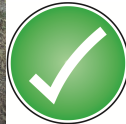
Optimal foot-plate position. (centred on the pad)